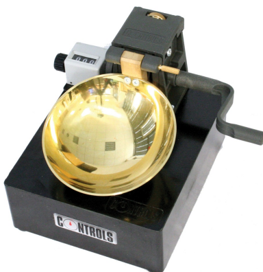
Liquid limit device, 22-T0030/AE